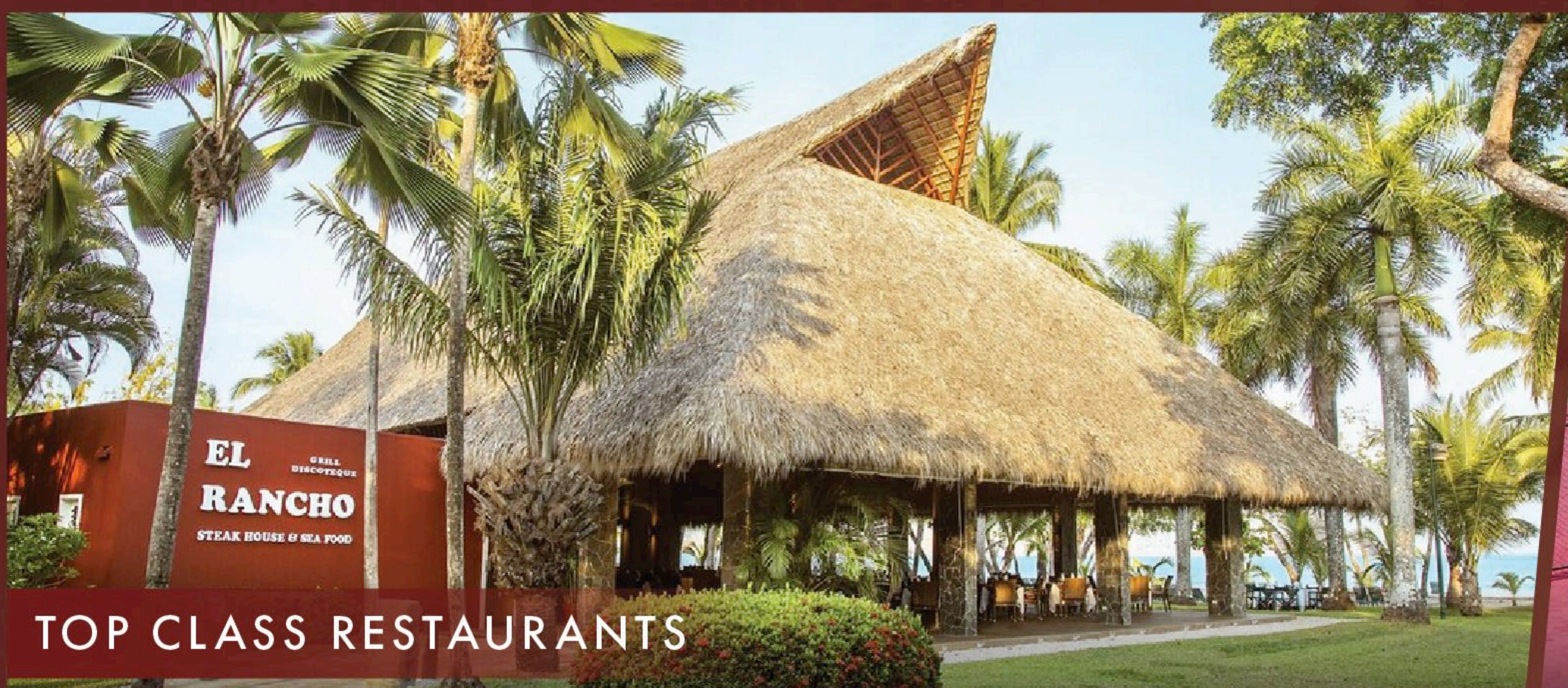
TOP CLASS RESTAURANTS